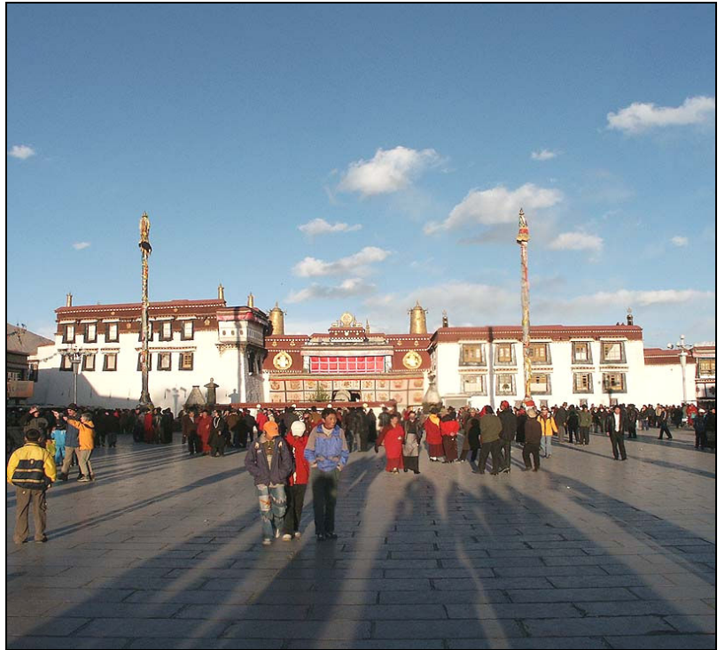
Jokhang Temple, Lhasa